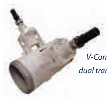
V-Cone Subsea with dual transmitters

Ask about our worldwide reference list with hundreds of installations